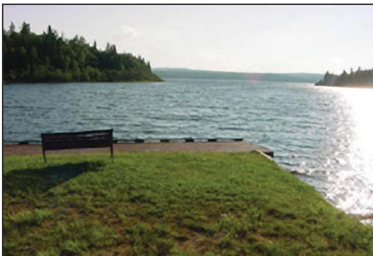
The lake at Fer a' Cheval Fishing Lodge