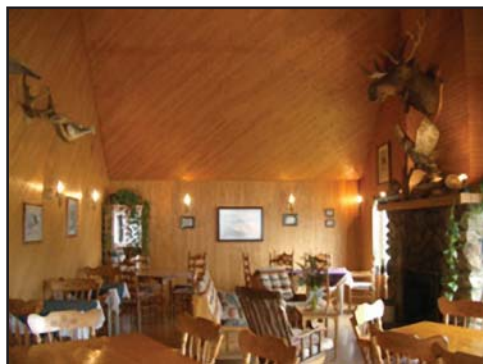
The dining room at Fer a' Cheval Fishing Lodge